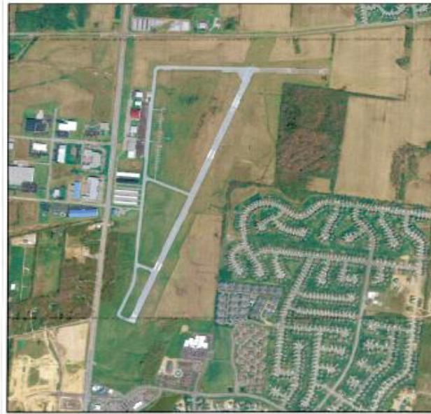
INDEX OF DRAWINGS